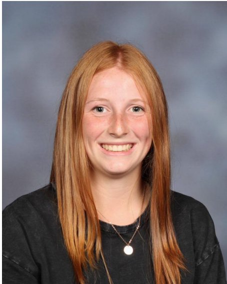
Chelsea Mower X-Country