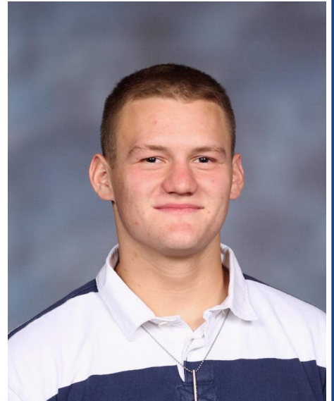
Easton Cook Football