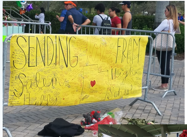
Our posters at the site of the MSD School memorial.

Several members of the MSD High School community have reached out to thank our school for the act of kindness. In the face of tragedy, your kind words have lifted spirits and let suffering people know you care.